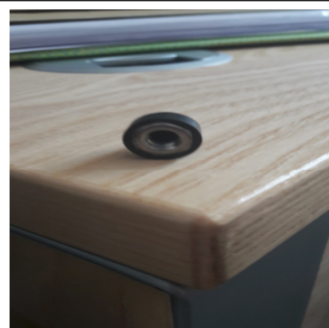
Nylock Nut which fell off

Issued by: Quality, Safety & Risk – North Leinster.