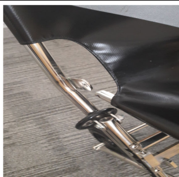
Missing Bolt & Nut

If any bolts are found to be loose or any other defects are noted, please arrange repair and withdraw from service in conjunction with supervisor and line manager. Please complete a defect form and a NIRF03 for any faults discovered.