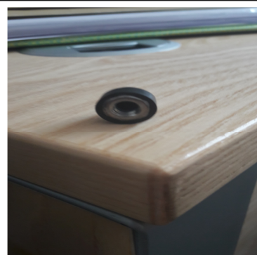
Nylock Nut which fell off

Issued by: Quality, Safety & Risk – North Leinster.